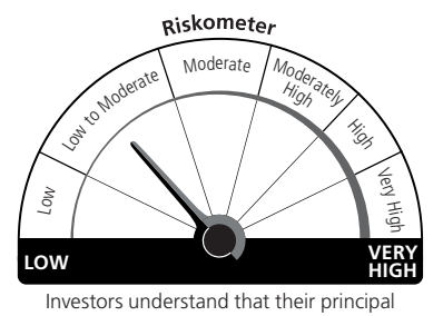
will be at moderate risk